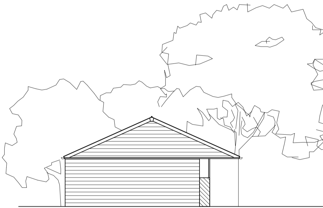
Existing Side Elevation 1:100@A1