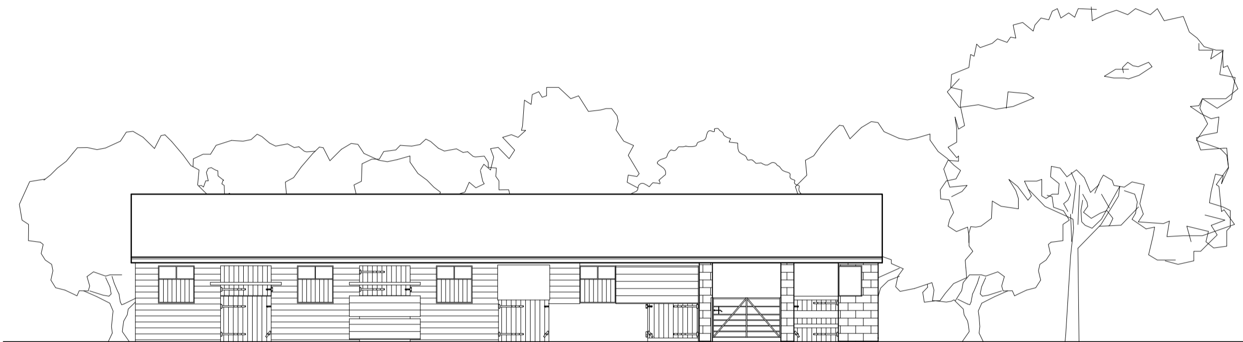
Existing Front Elevation 1:100@A1